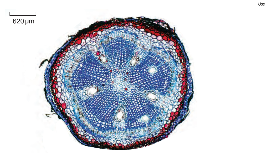
Fig. 2.2 is a photomicrograph of a transverse section through a root of a different plant species.